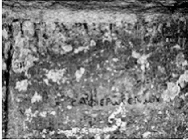
Συναγωγή Μαρκιωνιστών κωμ(ης) Λεβαβων του κ(υριο)υ και σω(τη)ρ(ος) Ιη(σου) Χρηστου προνοια(ι) Παυλου πρεσβ(υτερου) -- του λχ' ετους.

The plaque is dated 318 A.D. and reads "The Lord and Saviour Jesus, the Good" and is the earliest mention of Jesus in recorded history (Le Bas and Waddington, Inscriptions, No. 2558, vol. iii. p. 583) and more ancient than any dated inscription belonging to a Catholic church.